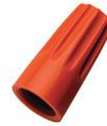
Wire Connector, 73B, Ora...