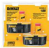
Battery Pack, 18V, NiCd, ...