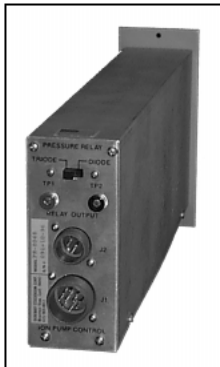
Figure I-2: Pressure Relay Rear Panel