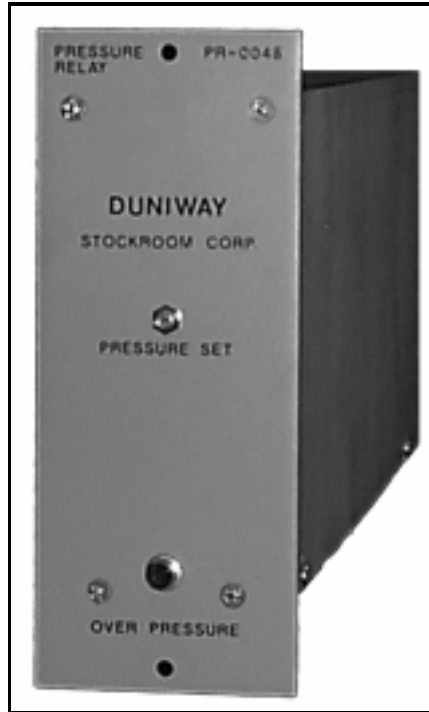
Figure I-1: Pressure Relay Front Panel