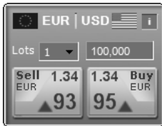
Figure 2-1: A dealing box from the FOREX.com trading platform for EUR/USD shows the current bid and offer price. The “bid” (on the left) is the price at which you can sell Euros. The “offer” on the right, is the price at which you can buy Euros.

For example, in Figure 2-1 the full EUR/USD price quotation is 1.3493/95. The 1.34 is the big figure and is there to show you the full price level (or big figure) that the market is currently trading at. The 93/95 portion of the price is the bid/offer dealing price.